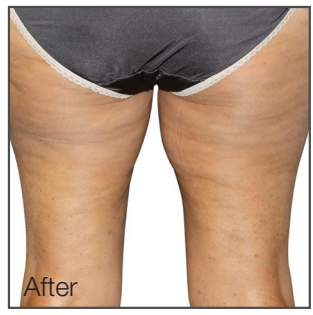
Results after 10 treatments